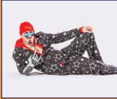
HEATBOX 8 p.m.