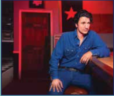
DRAKE MILLIGAN 8:30 p.m.