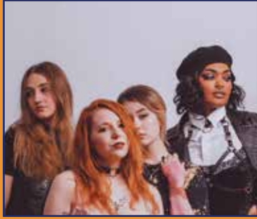
GULLY BOYS 8 p.m.