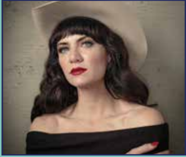
NIKKI LANE 8:30 p.m.