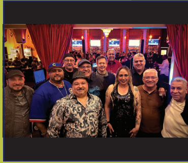
TROPICAL ZONE ORCHESTRA 8 p.m.